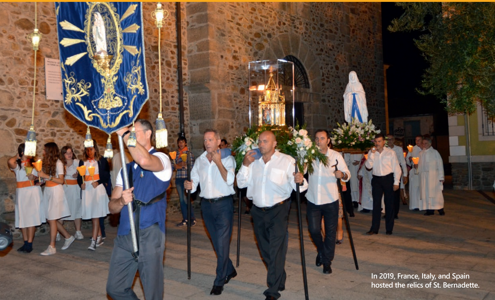
In 2019, France, Italy, and Spain hosted the relics of St. Bernadette.